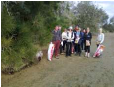
Tomakin Coastcare group on their first day