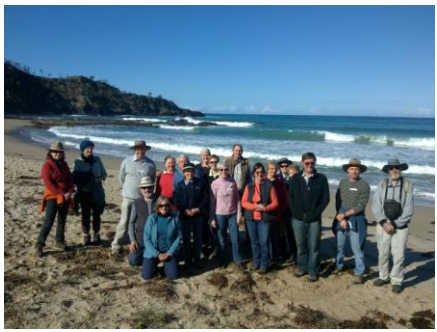
Burrawang Coastal Issues Workshop