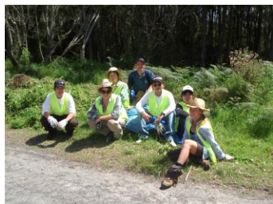
Conservation Volunteers Australia at Handkerchief Beach