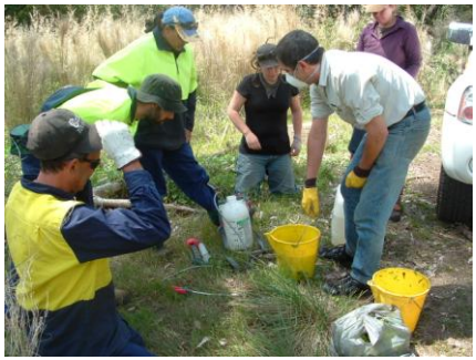
Wagonga Rangers at Tuross