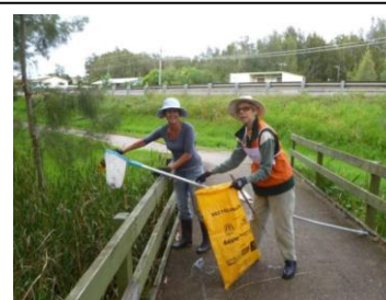
Lilli Pilli / Malua Bay Clean Up Australia Day