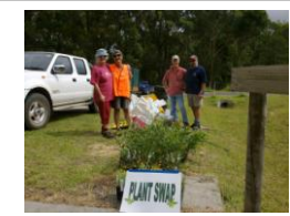
Bingie Plant Swap