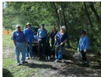
Mosquito Bay Bushcare