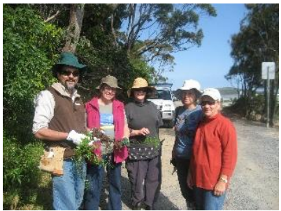
Akolele Bushcare training