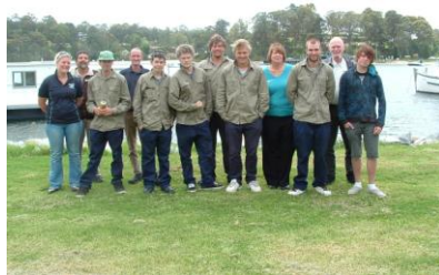
National Green Jobs Corps