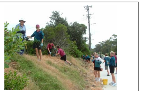
Carroll College Planting at Broulee