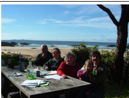
Mystery Bay Action Planning