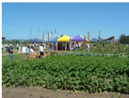
SAGE Moruya Community Garden