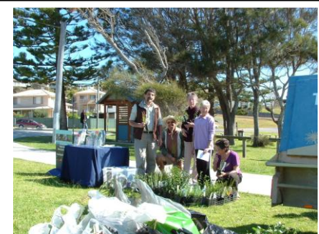
Dalmeny Plant Swap